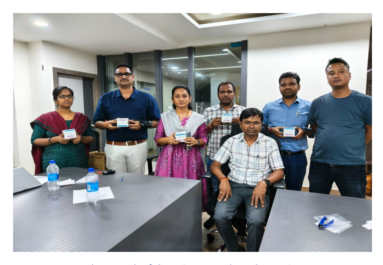
Photograph of the Seizure Conducted at Karimnagar