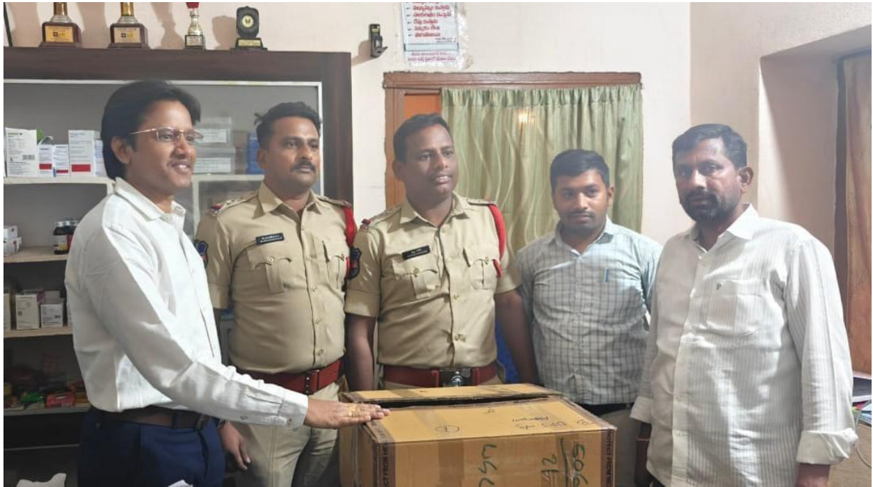
B) Photograph - Seizure of drugs falsely manufactured and sold under the guise of 'food products/nutraceuticals' in Peddapalli