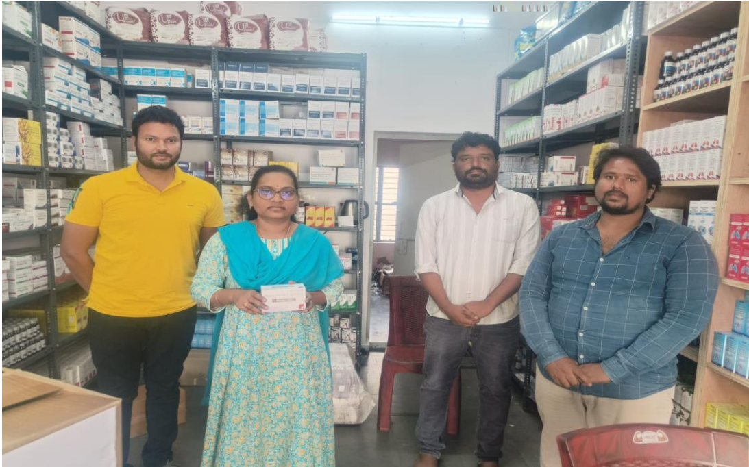
Photograph – Raid Conducted at a Hospital in Mahabubabad Village, Mahabubabad District