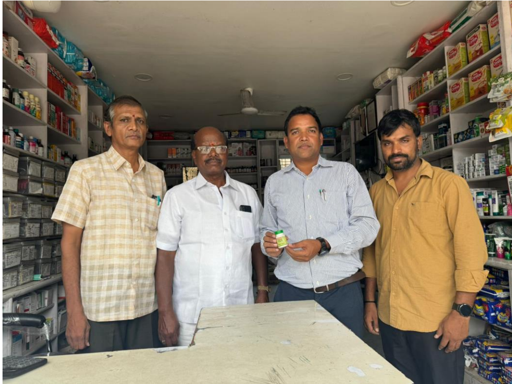
Photograph of Seizure carried out regarding Misleading Advertisements at Siricilla: