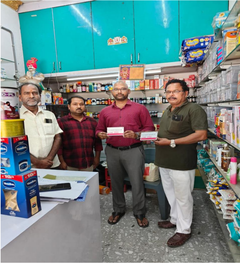
Photograph of Seizure carried out regarding Misleading Advertisement at Suryapet