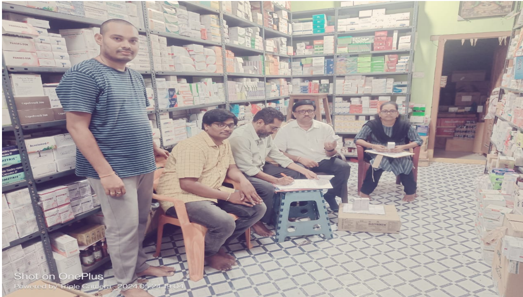
Photograph of Seizure of ayurvedic medicine 'Ayu RC Syrup' in Narayanpet for making misleading advertisement