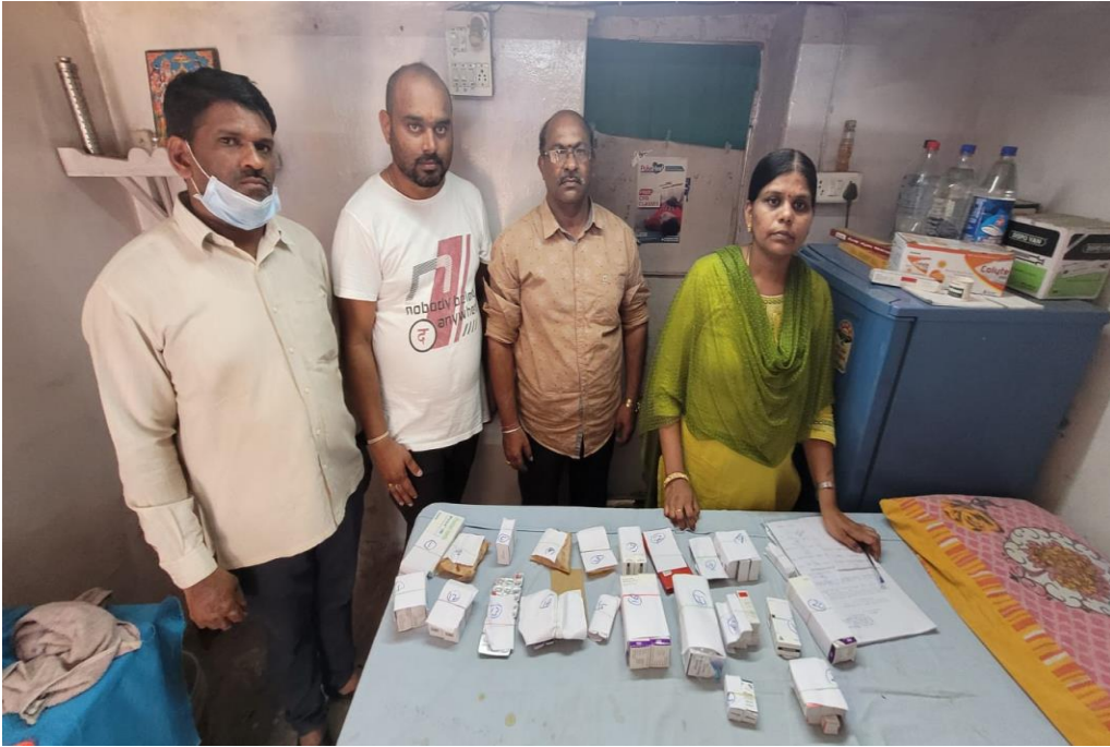
Photograph of Seizure carried out regarding misleading advertisement at Patancheru