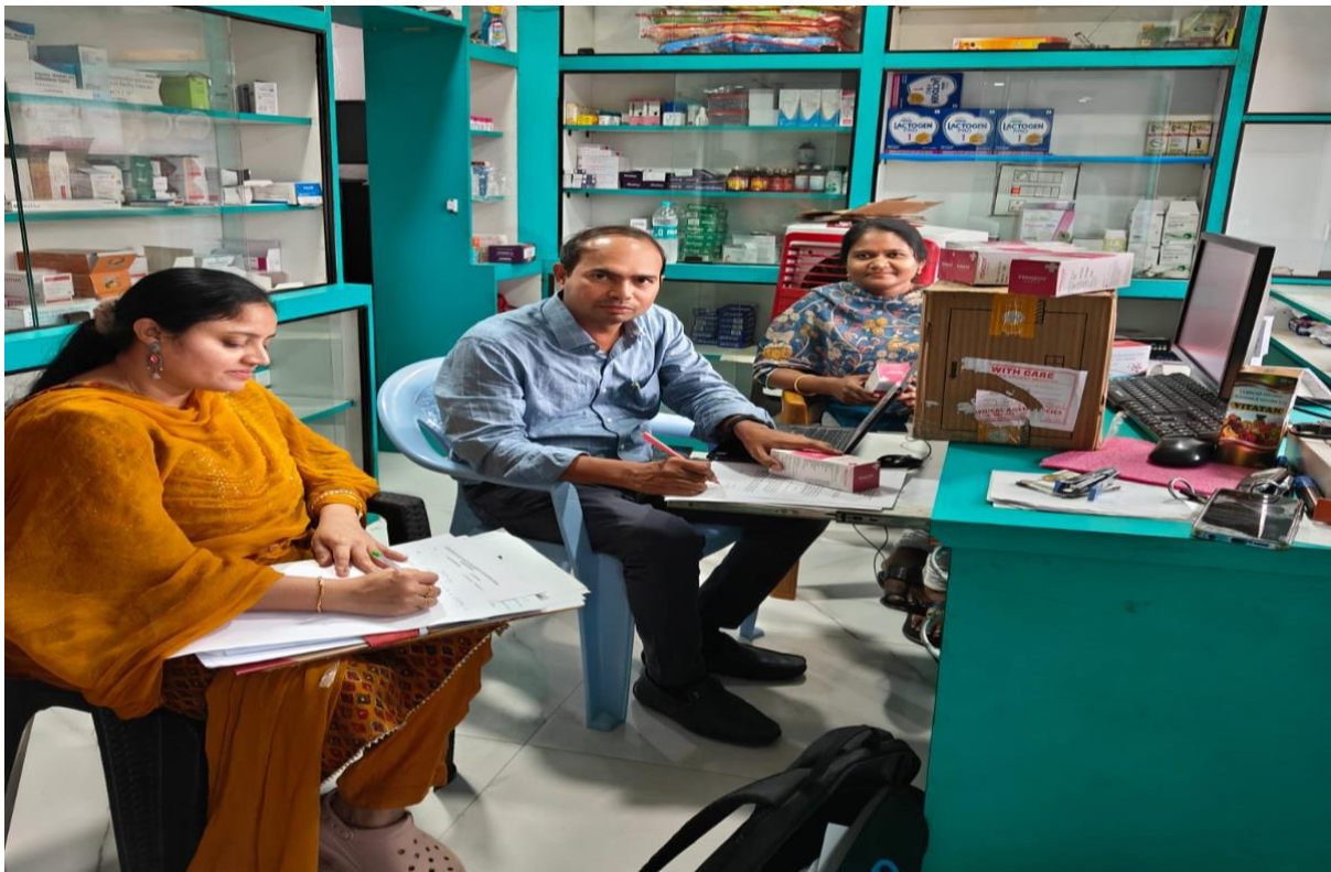
Photograph of Seizure carried out at quacks clinic in Nizampet Village, Medak District