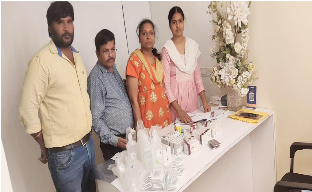
Photograph of Seizure carried out at Quacks Clinics