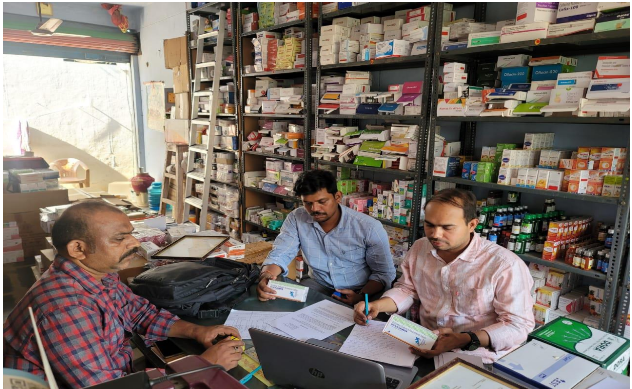
Photograph of Seizure carried out at Aiza Village, Jogulamba-Gadwal District for Misleading Advertisement