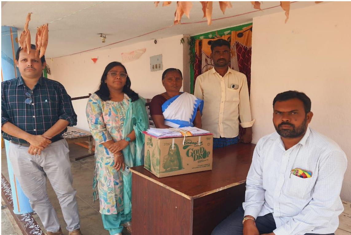
Photograph of Seizure carried out at a quack's clinic in Adilabad