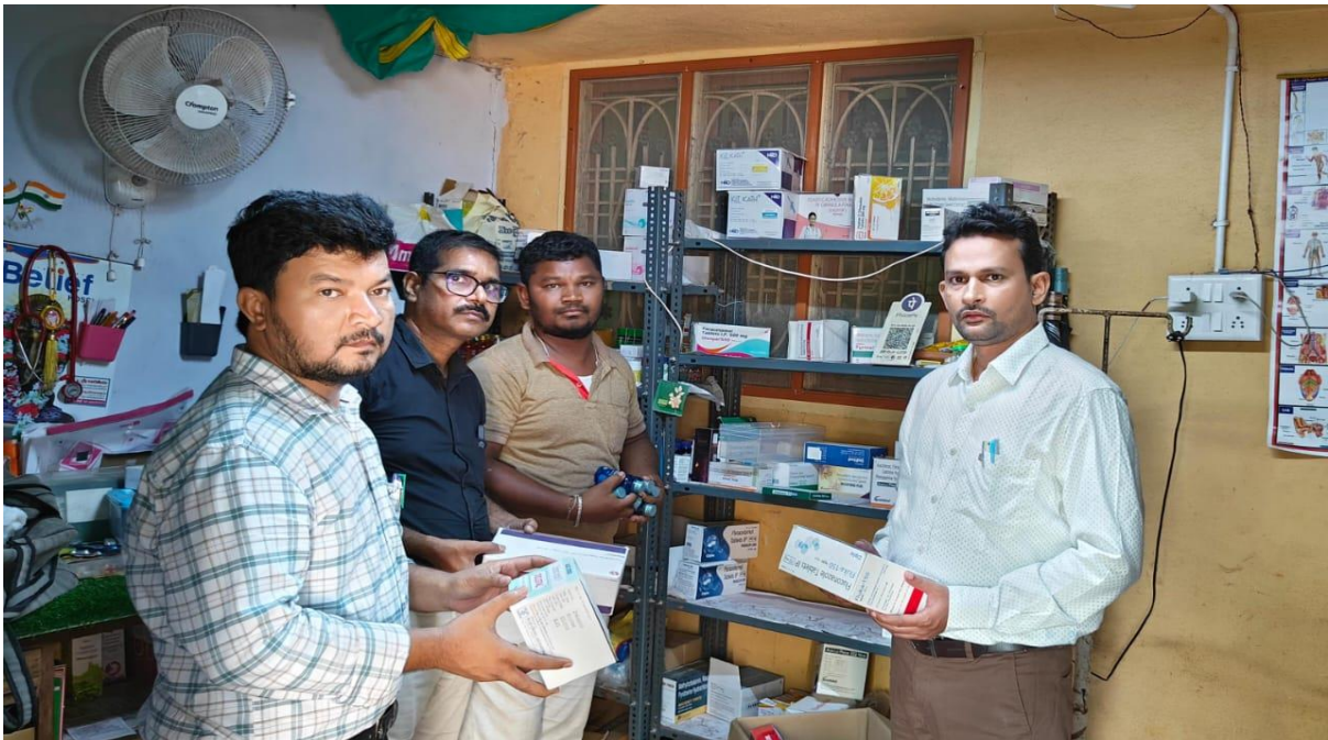
Photograph of Seizure carried out at Terpole Village, Kondapur Mandal, Sangareddy District