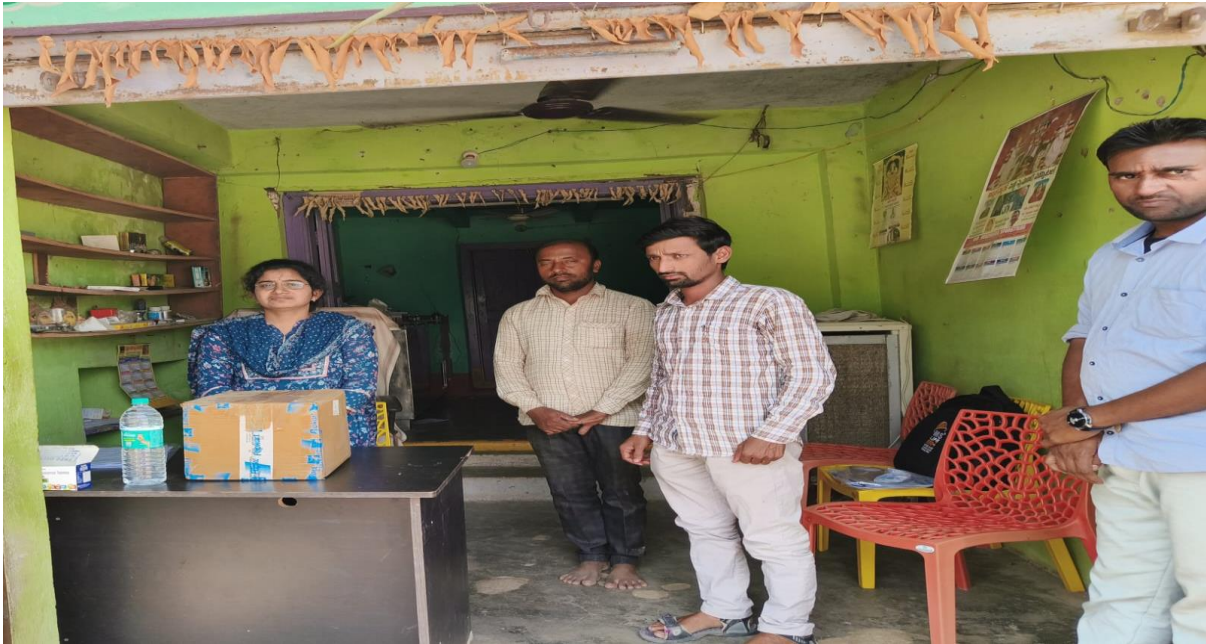
Photograph of Seizure carried out at Sugur Village, Pebbair Mandal, Wanaparthy District