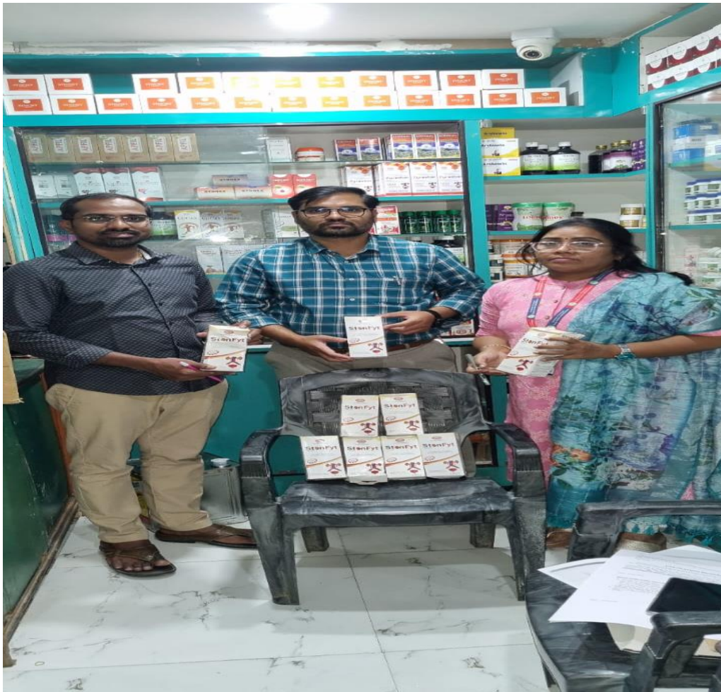
B) Photograph of Seizure carried out in Gandipet for making misleading advertisement: