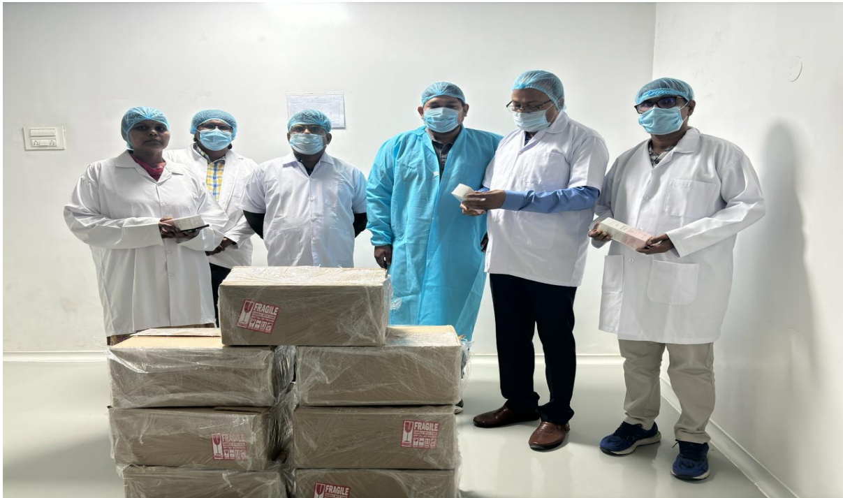
Photograph of Seizure conducted at Vikarabad for price violation