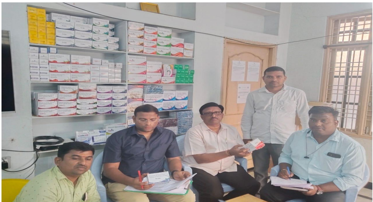
Photograph of Seizure of Banned Drugs Conducted in Karimnagar